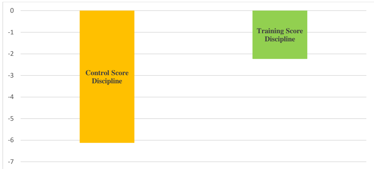
Figure 3. The cumulative differences in average scores between the "control" and "training" phases for bowling discipline