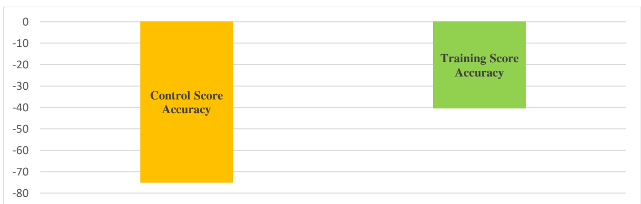
Figure 2. The cumulative differences in average scores between the "control" and "training" phases for bowling accuracy